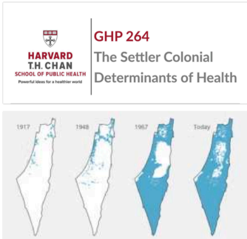
GHP 264: The Settler Colonial Determinants of Health at Harvard T.H. Chan School of Public Health

“case studies from the United States and Palestine/Israel.” 92 As of the 2025 semester, this advocacy course under the facade of public health was no longer taught.