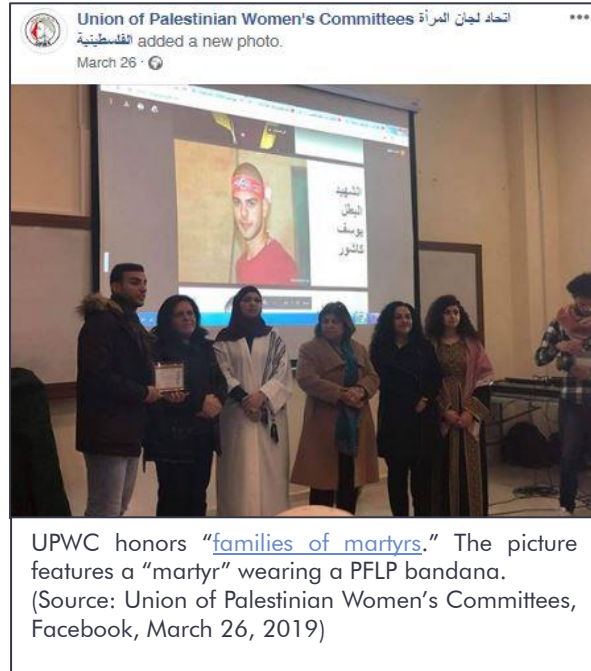
UPWC honors " families of martyrs ." The picture features a "martyr" wearing a PFLP bandana.