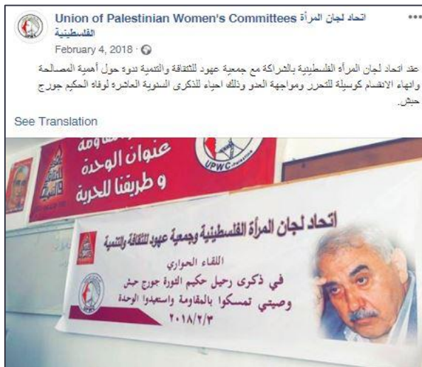
UPWC organized an event in commemoration of the PFLP's founder George Habash .