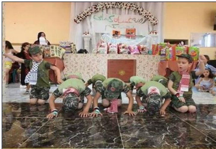
Pictures of the festivities marking the end of the 2017 Ghassan Kanafani project. The pictures are published on UPWC’s Facebook account and feature children wearing uniforms or T-shirts of Kanafani . One child is seen lying down on the floor with a gun. Others are dancing around with knives. One picture also presents children holding a poster of what appears to be PFLP prisoners.