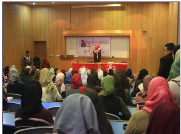
UPWC and Progressive Student Action Front Ceremony with banner of Leila Khaled (Source: PFLP, " The Student Action Front and the Union of Women's Committees honor the active and successful student ." March 11, 2019)