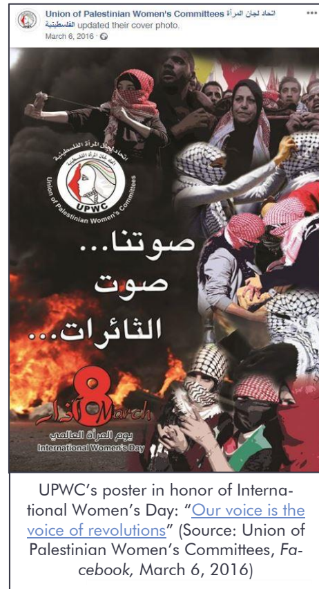
UPWC's poster in honor of International Women's Day: " Our voice is the voice of revolutions "