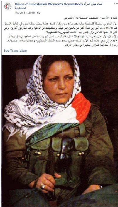
Post commemorating the terrorist Dalal Mughrabi .