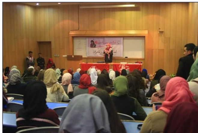
UPWC and Progressive Student Action Front Ceremony with banner of Leila Khaled