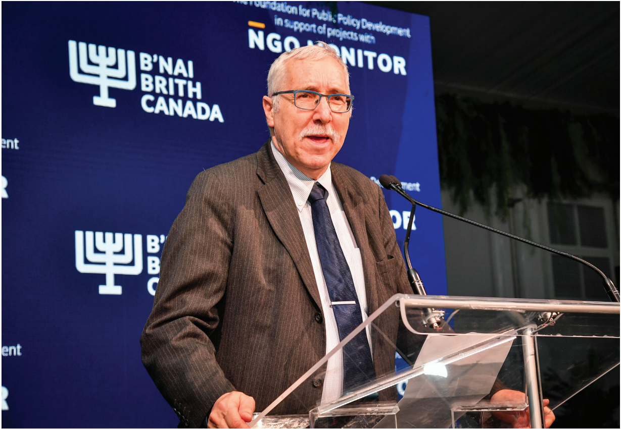
Ryan Blau of PBL Photography