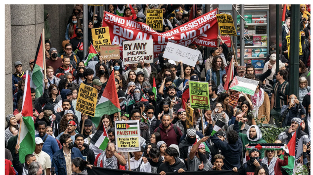
Demonstrators march in support of the Palestinian people on October 8, 2023, in New York City.