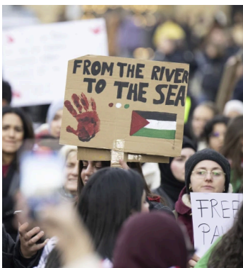
stration, in Frankfurt, Germany, Friday, Nov. 3, 2023. The Jordan River is a winding, 200-plus-mile glittering Mediterranean to its west. But a phrase about the space in-between, "from the river to the sea," has become a rallying cry for Jews and pro-Palestinian activists in the aftermath of Hamas' murderous rampage in Gaza.