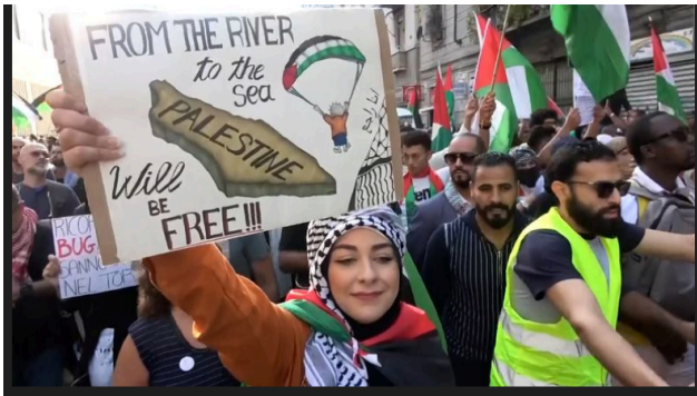
Downing Street condemns 'from river to the sea' projection on Big Ben, February 23, 2024