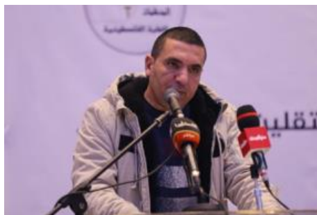
PFLP Prisoners Committee Official Ka'abi speaking in front of the PNGO logo.