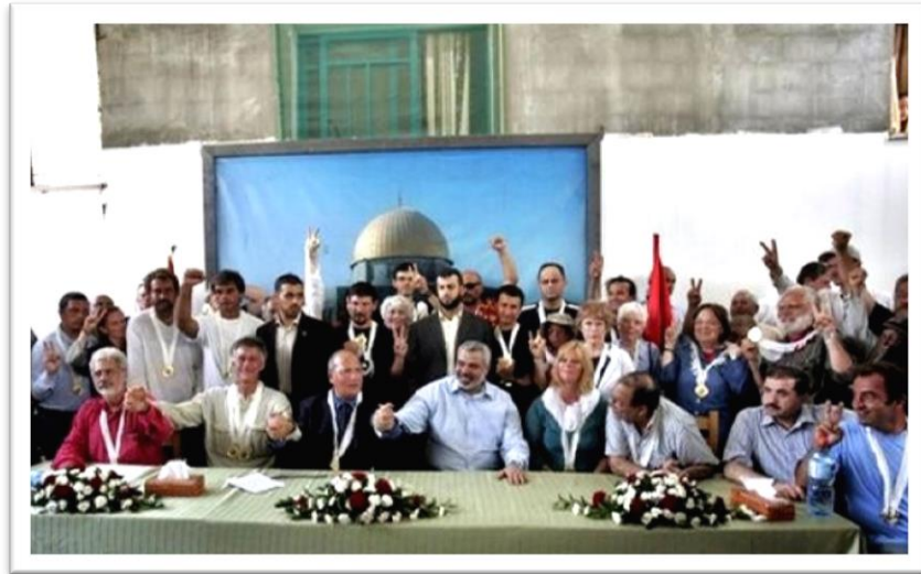
Hamas Prime Minister, Ismail Haniyeh, center, sits with members of the U.S.-based Free Gaza group, which left Cyprus by boat on Friday, during a meeting at his house in Gaza City, Sunday, Aug. 24, 2008. Two boats carrying dozens of international activists sailed into the Gaza Strip in defiance of an Israeli blockade on Saturday.